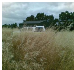
Non – compliance

COMPLIANCE WITH THIS NOTICE IS REQUIRED BY 1 NOVEMBER EACH YEAR AND IS TO BE MAINTAINED UNTIL 30 APRIL EACH YEAR OR AS OTHERWISE GAZETTED