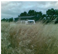
Non – compliance