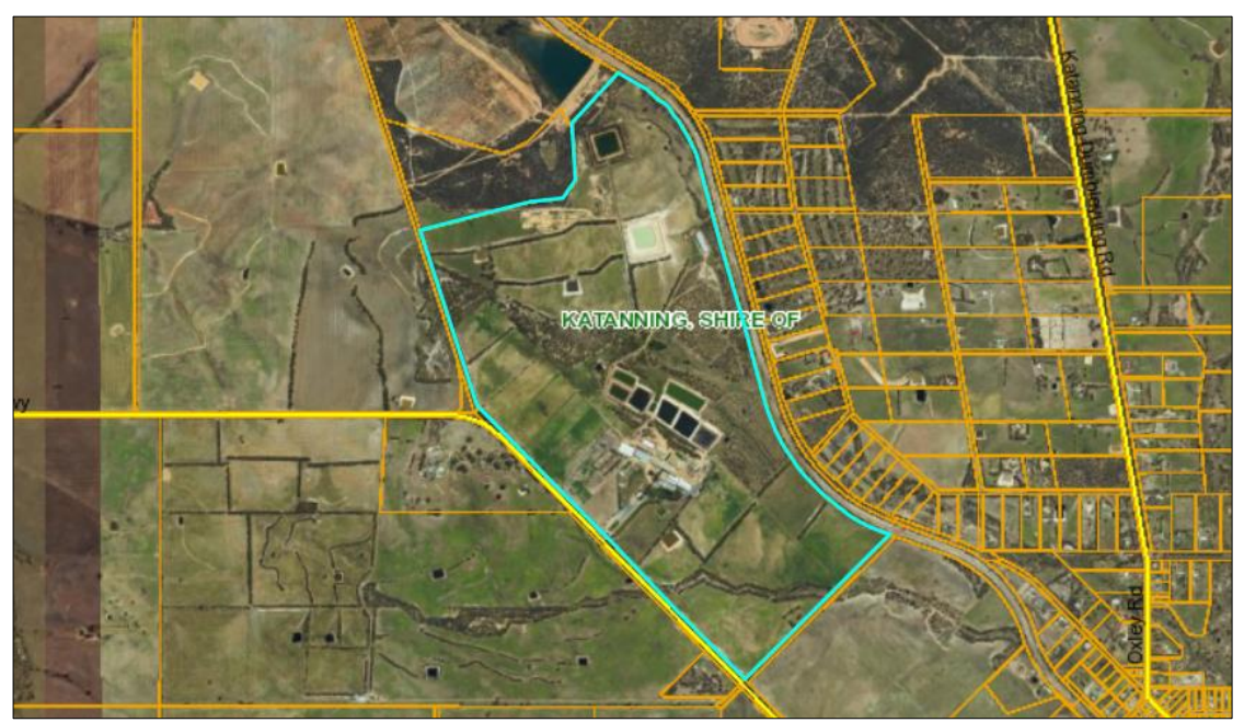
Aerial image of Lot 3 (28013) Great Southern Highway

Following preliminary enquires in March, a Development Application was received for the installation of a shed, tanks and 'Reverse Osmosis' system at the Abattoir. The plans show a 6m long 2.5m wide 2.87m high steel frame metal clad shed, five (5) 50kl round poly water tanks and the plant to enable re-use of wastewater. The proposed structures will be located north east of the existing Abattoir buildings, adjacent to the storage dams.