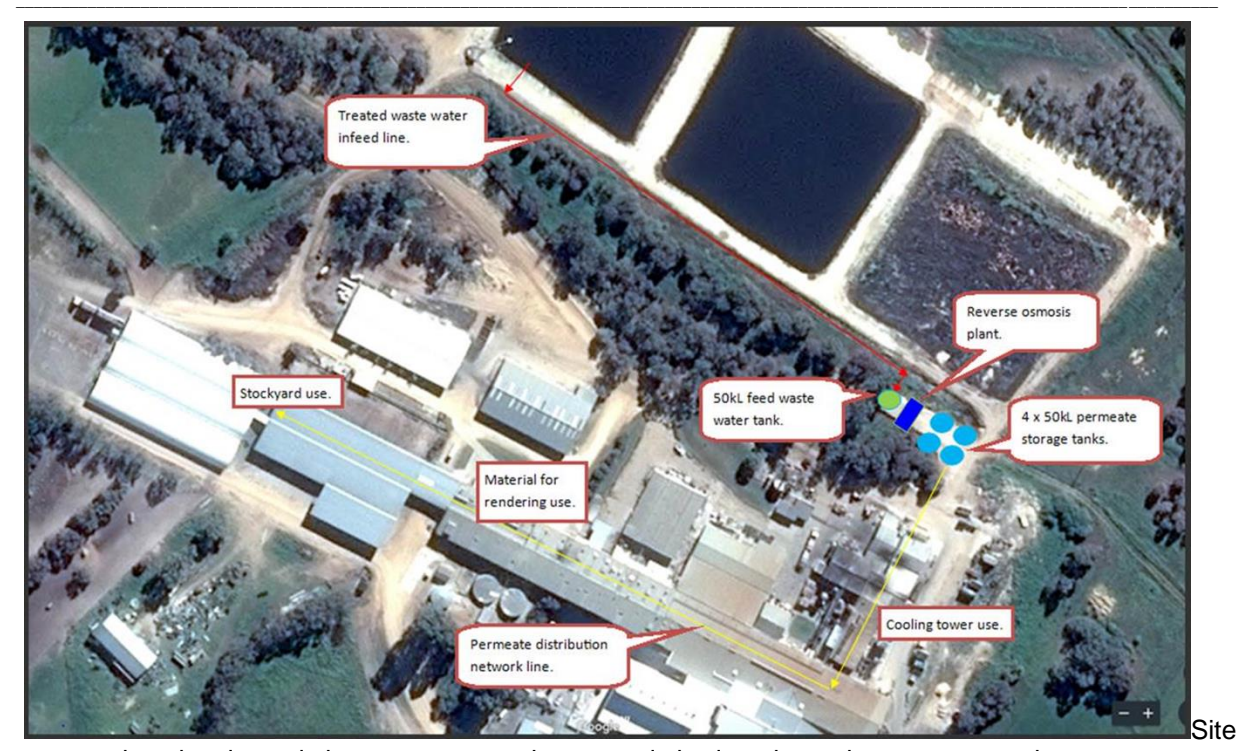
plan showing existing structures and proposed shed, tanks and reverse osmosis system.