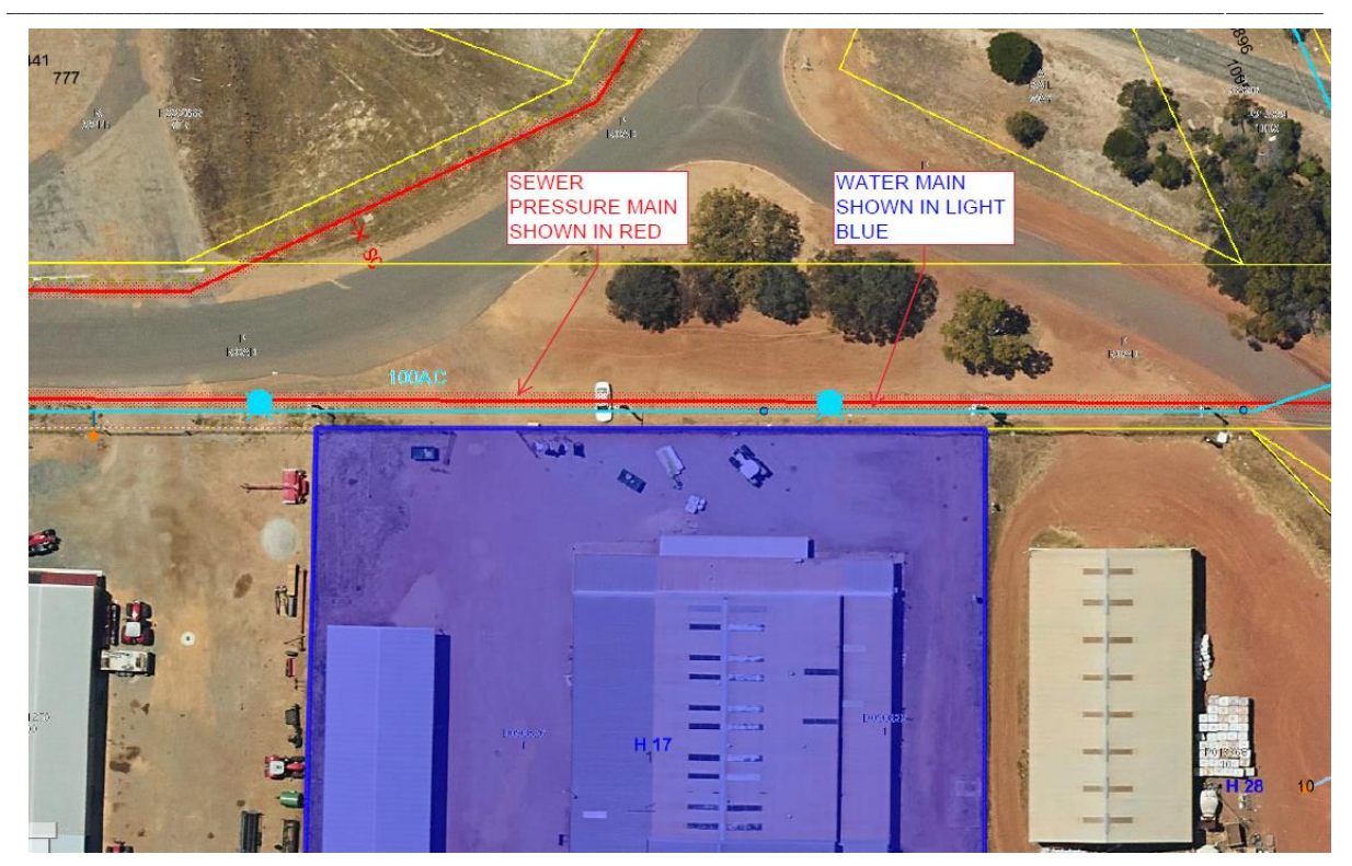
Water Corporation Submission Plan (February 2023)

Council should note all costs associated with dealing with the Water Corporation's requirements will be the responsibility of Harvest Centre Holdings Pty Ltd and must be addressed by them in consultation with the Water Corporation and the Department of Planning, Lands and Heritage to allow the road closure process to be finalised if it is ultimately approved by the Minister for Lands. Harvest Centre Holdings Pty Ltd have been advised of the Water Corporation's requirements and are understood to have engaged a consulting civil engineer to investigate and prepare a detailed costing for all the work required to provide for the relocation of the water main and associated water meter.