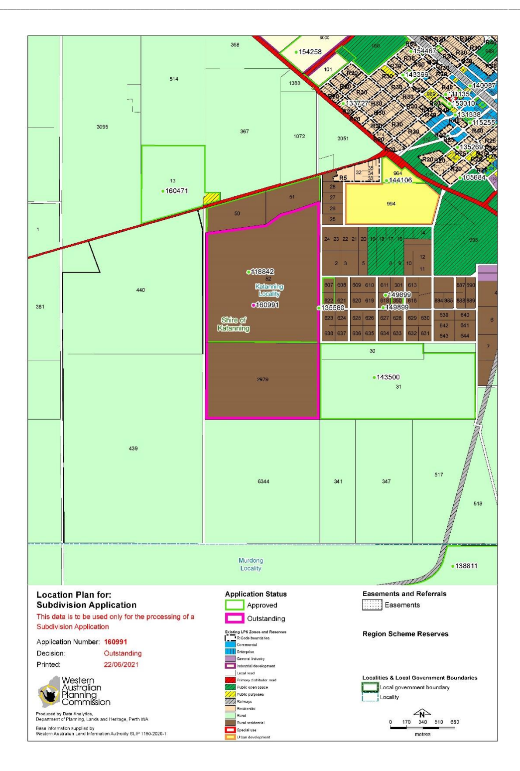
Lots 52 and 2979 Illareen Road, and adjacent Lots 50 and 51 Kojonup – Katanning Road are the subject of Structure Plan SPN/2199, endorsed by the WAPC on 12 November 2020. (refer Figure 1 of Attachment)