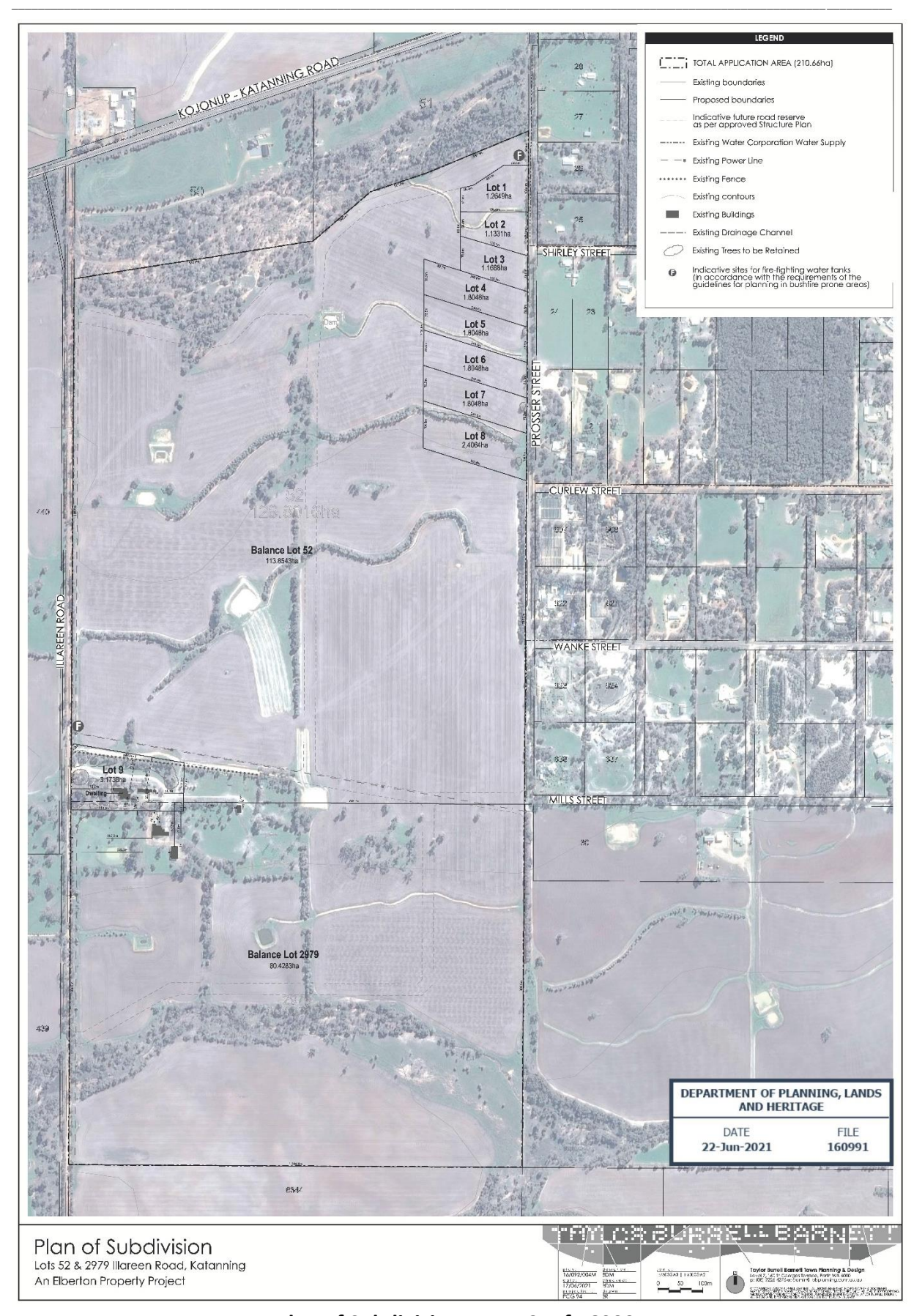
Plan of Subdivision-WAPC ref 160991

The subject land is zoned Rural Residential 3 under the Shire of Katanning Local Planning Scheme No.5 (LPS). Refer WAPC Zoning and Application location display plan below.