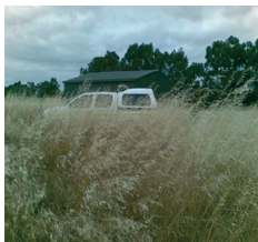
Non – compliance