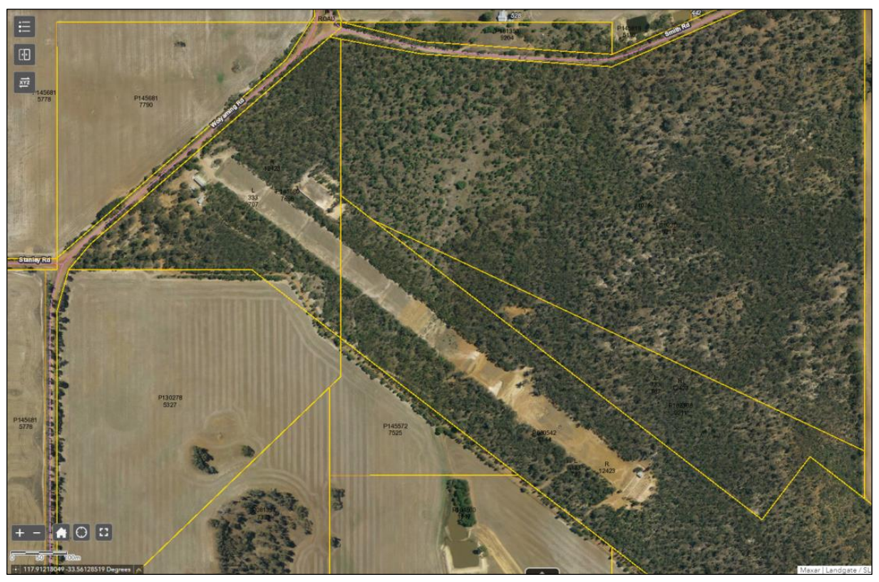
Aerial view of front portion of Subject Land

Correspondence from both Wurgabup Inc. representing the Wurgabup Rifle Club and the Wurgabup Sporting Shooters Association of Australia, and the West Australian Rifle Association Inc. is attached.