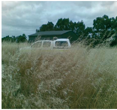
Non – compliance