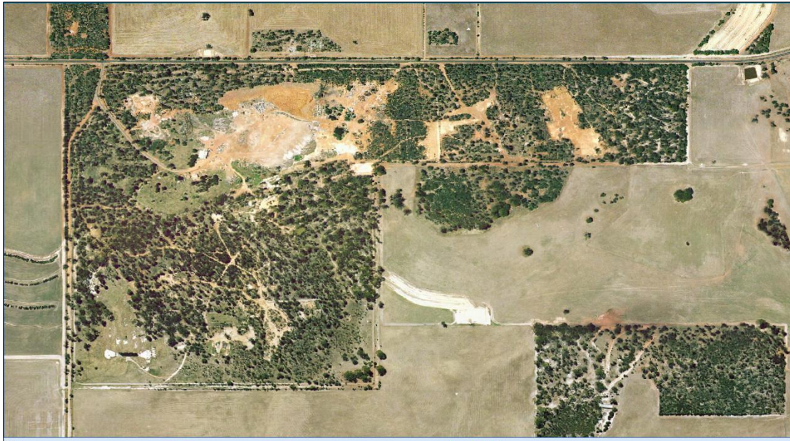
2006 Aerial Image