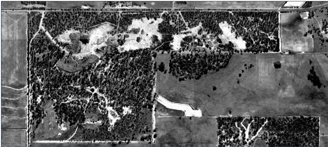
1996 Aerial Image

Rationalisation of these three existing Reserves, including standardisation of purpose and power to lease, will facilitate development and use of the entire site as a Waste Management Facility.