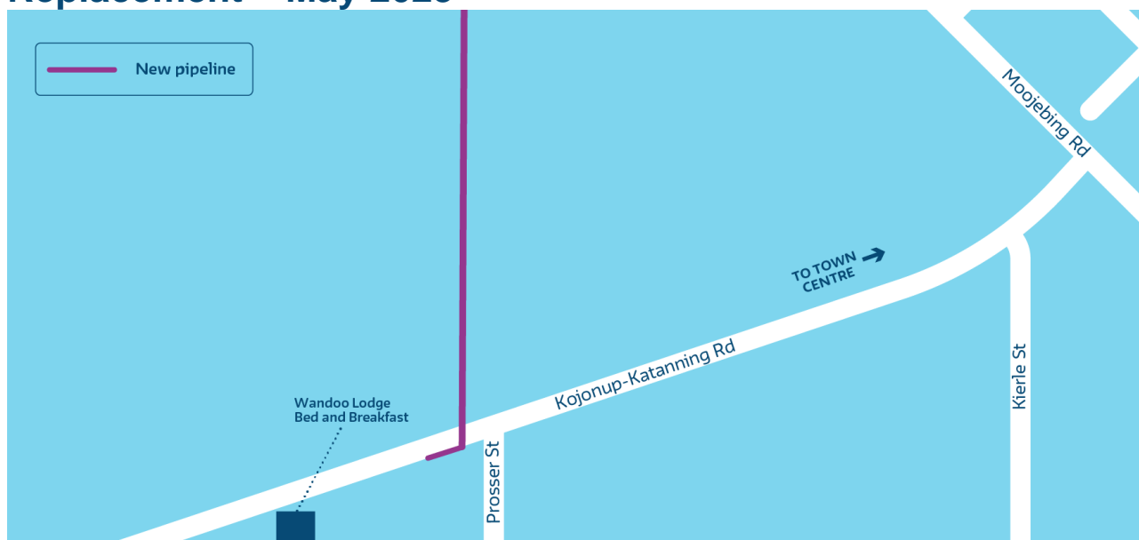
Map 2: New Kojonup-Katanning Road pipe alignment.