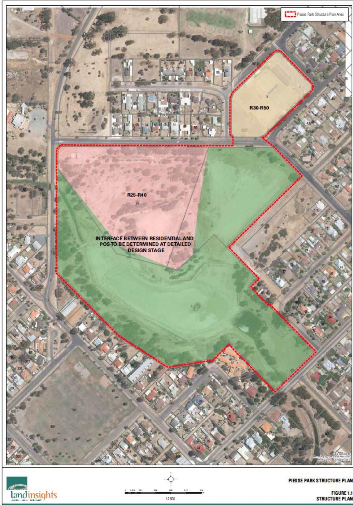
Figure 1 – Piesse Park Structure Plan