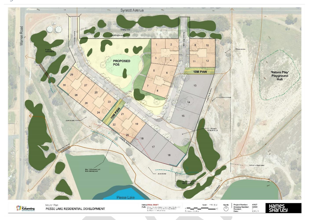
Figure 2 – Piesse Lake Residential Master Plan