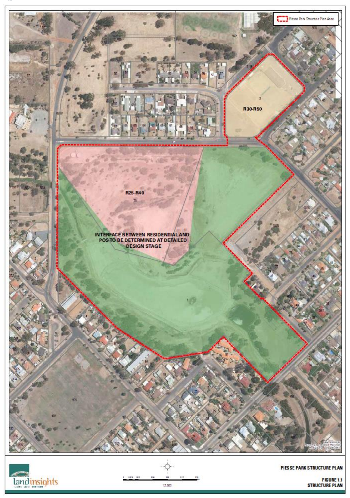
Figure 1 – Piesse Park Structure Plan