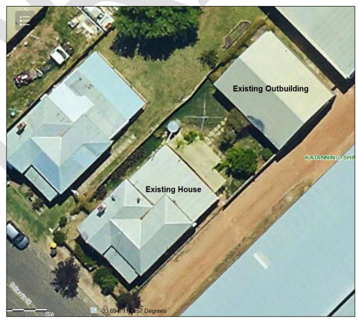
Aerial view of Lot 5 Britannia Street