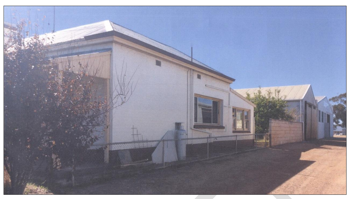
View of Laneway