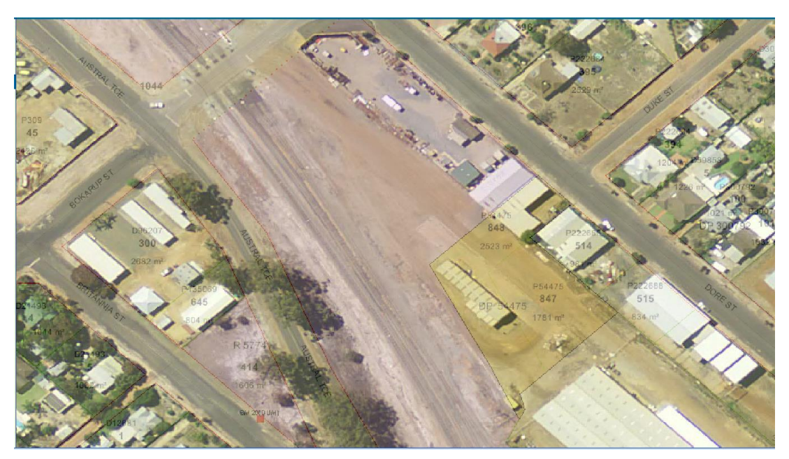
Aerial view of subject property and surrounds. Vacant shed on Pt Lot 848 associated parking and access on Pt Lots 847 & 559.

Issue: To consider a proposal for the Katanning Men's Shed to use portion of Reserve 15750, Pt Lots 847 and 848 Dore Street for 'Community Purpose', with access via portion of Reserve 10422, Lot 559 (48-50) Dore Street.