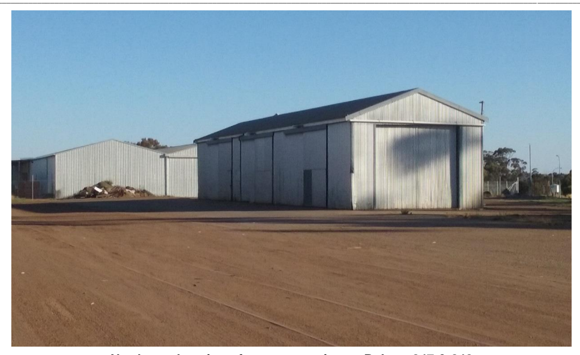
Northern elevation of vacant premises - Pt Lots 847 & 848

The property is zoned 'Commercial' under the current Shire of Katanning Town Planning Scheme No. 4 (TPS4). The applicable definition for the proposed land use is: