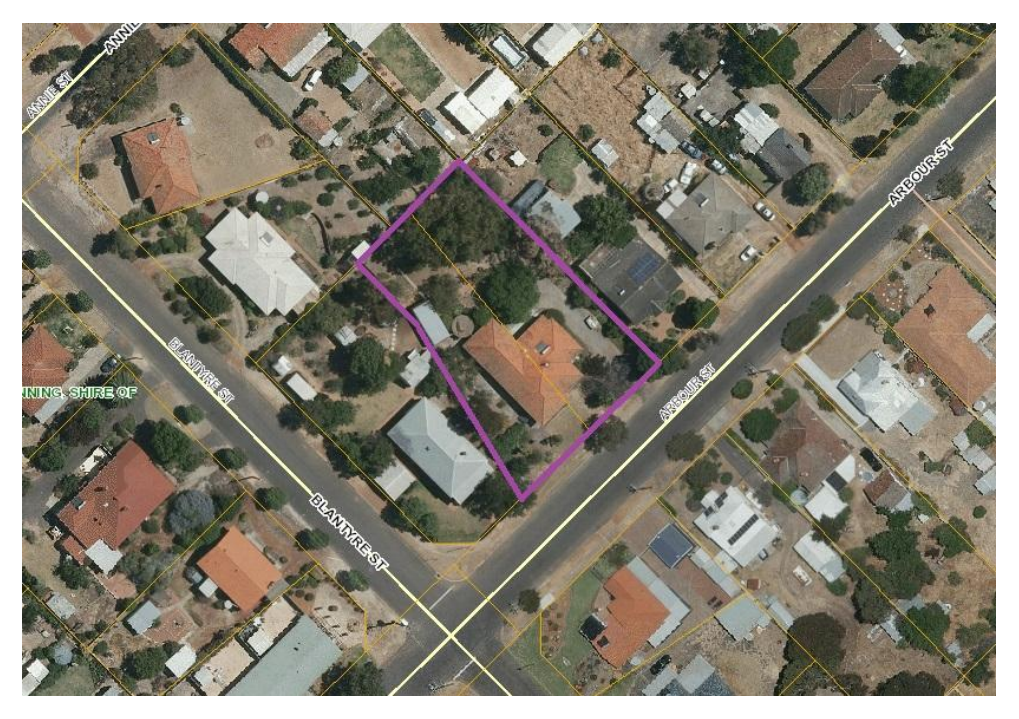
Aerial image of Lots 13 & 14 (36) Arbour Street and surrounds

The applicant has advises the Outbuilding will be used to garage private vehicles and for storage.