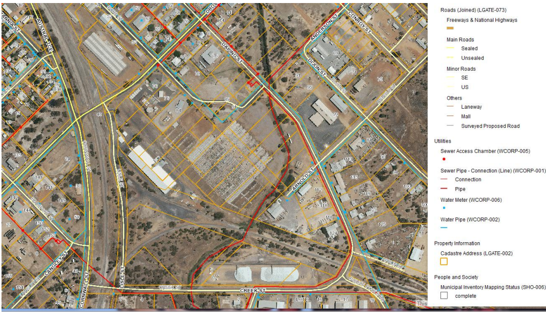
Former Sale Yards – Aerial with Utilities and Services

All the Lots are the subject of Memorial K761385 ML – Contaminated Sites Act, Registered 4 November 2008.