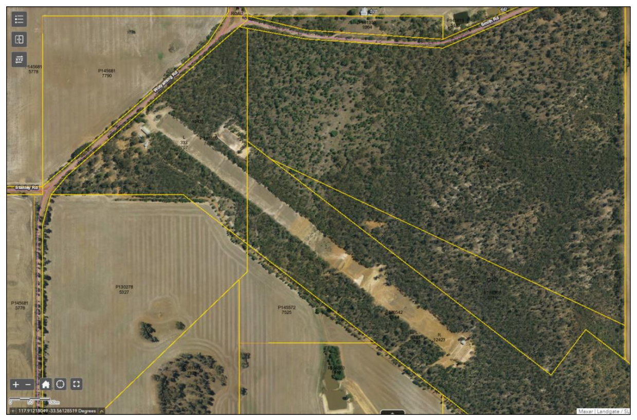
Aerial view of front portion of Subject Land

Correspondence from both Wurgabup Inc. representing the Wurgabup Rifle Club and the Wurgabup Sporting Shooters Association of Australia, and the West Australian Rifle Association Inc. is attached.