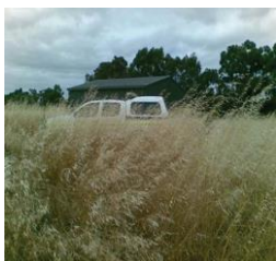
Non – compliance

COMPLIANCE WITH THIS NOTICE IS REQUIRED BY 1 NOVEMBER EACH YEAR AND IS TO BE MAINTAINED UNTIL 30 APRIL EACH YEAR OR AS OTHERWISE GAZETTED